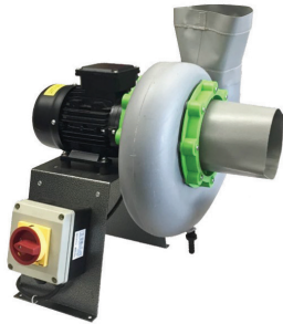
Fume Extraction Fan

We will customise your complete fume extraction fan kit by discussing the available space, current set up, mounting options and operating and duty points of your fume cupboard to determine the exact contents of your complete kit. We'll then decide the right size polypropylene scroll (or multiple options if more than one is required) for your system along with the correct motor, pedestal (indoor or weatherproof outdoor) and inverter to meet your project airflow requirements.