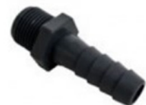
Drain Hose Connector