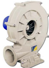
PLATE MOUNTED FAN

Forward-curved impeller blades. Spigots Ø80 to Ø180 Flow rates to 3550m 3 /h. Pressures to 4000pascals