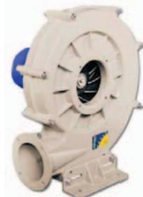
PLATE MOUNTED FAN

Forward-curved impeller blades. Spigots Ø80 to Ø180 Flow rates to 3550m 3 /h. Pressures to 4000pascals